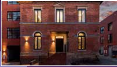
Project by Vantage & Co Group Limited