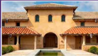
Project by Stonewood Builders Ltd