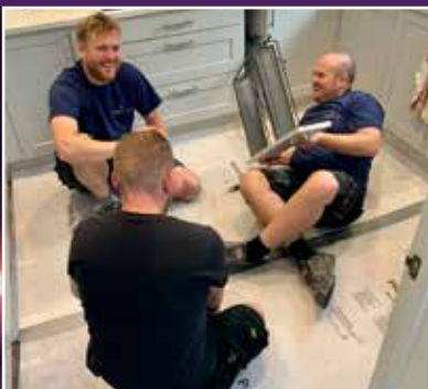
Project by Keestone Ltd