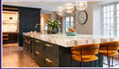
Project by J C Building Services

606 nominations 11 categories 800 attendees