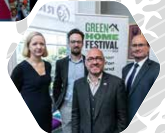
Zero Carbon Buildings Minister Patrick Harvie MSP at the Green Home Festival