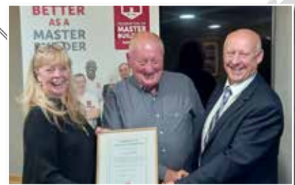
FMB NI with National President

FMB Northern Ireland has worked closely with FMB Insurance Services to improve the warranty scheme that gives members access to public sector grant aided works. Market conditions makes this an ongoing challenge, but we will continue to meet it head-on.