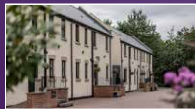
Project by Radford Construction Services Ltd