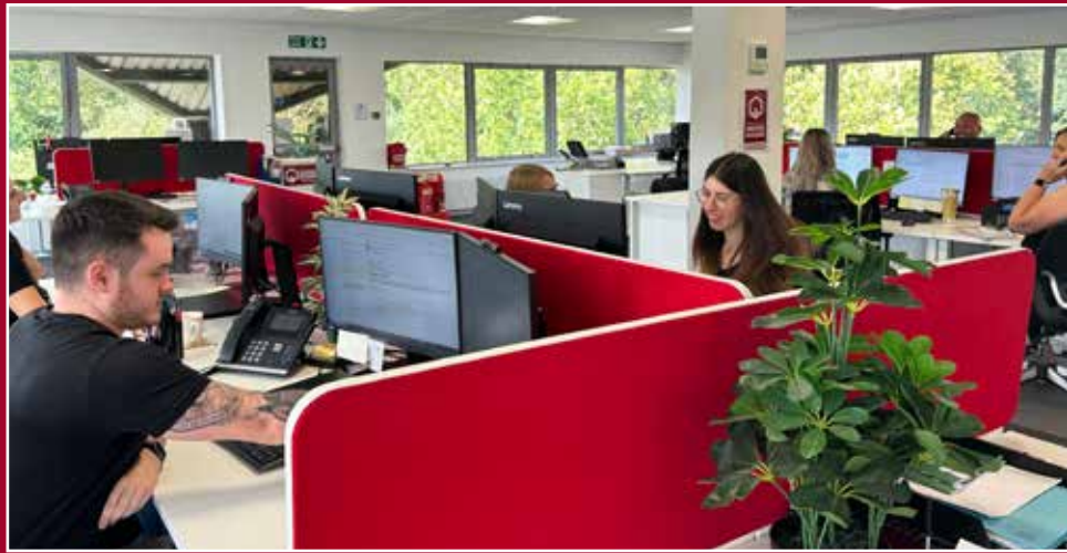
New FMB Insurance offices

We are committed to continued professional development of the team and are supporting individuals through insurance apprenticeships