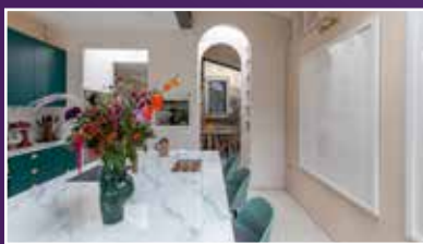
Project by Pencil and Brick Ltd