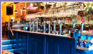
Project by Rhodes Joinery & Building Services Ltd