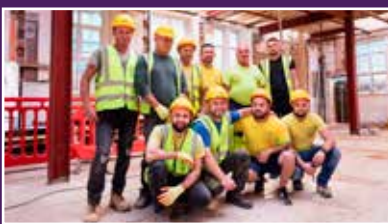
Home Republic Ltd