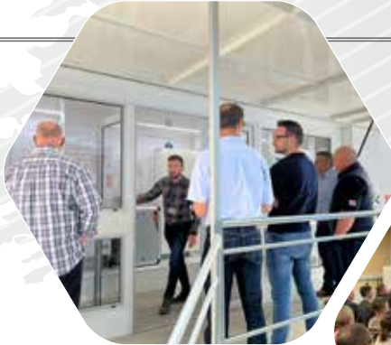
Wales Board visit Construction Wales Innovation Centre

Our constructive relationship with the Welsh Government remains strong as we strive to represent members' interests in all the areas that matter. We have a seat on the Construction Forum which is the highest level of engagement between the industry and the Government. The meetings are chaired by the Minister for the Economy and is an opportunity for both sides to explore solutions to the challenges faced by industry. We also sit on the House Builders' Engagement Group, which is attended by the FMB Wales Director alongside several of our house building members. A key success for us on the house building front was the extension of the Help to Buy scheme, a scheme that has been discontinued in