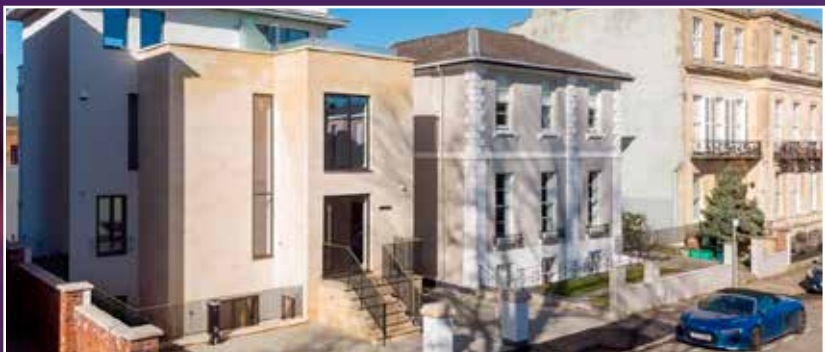
Project by Thorn Homes Ltd