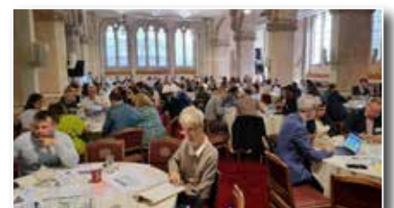
Skills for Sustainable Skyline Taskforce