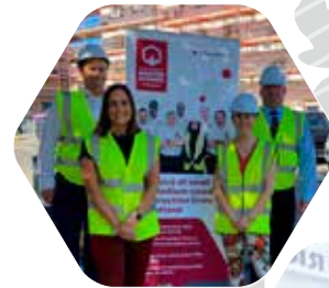
Green Home Festival A.C. Whyte & Co Ltd