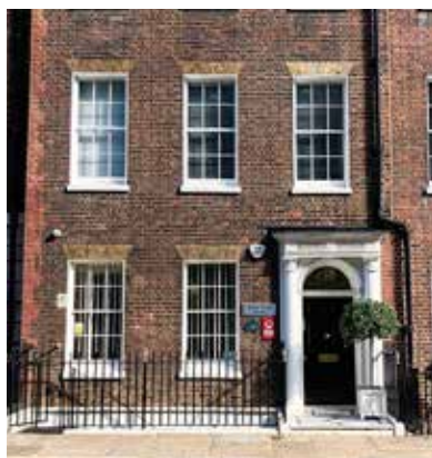
The FMB's central London office in Ely Place