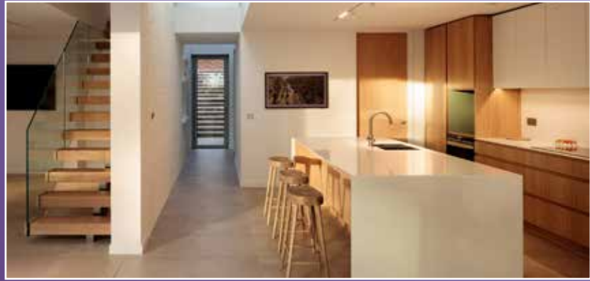
Project by IPSUM (UK) Ltd