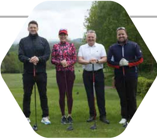
Charity South West Golf Day

FMB South continued to represent members' interests on several platforms this year. Our FMB South Director was interviewed on many regional BBC radio and television channels to promote FMB campaigns and to discuss some of challenges faced by members. We also promoted Master Builders by exhibiting at several consumer facing shows, such as the Homebuilding Renovating show in Surrey, where a number of members provided homeowners with tips and advice on running a successful building project. Our Director presented at many conferences this year, such as the Low Carbon Homes Retrofit