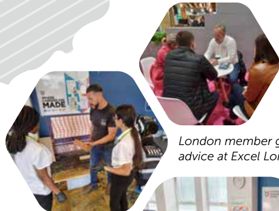
London member giving advice at Excel London