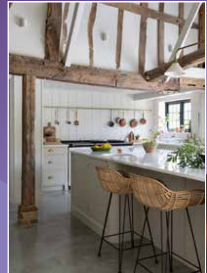
Project by Phoenix Design and Construction (South East) Ltd