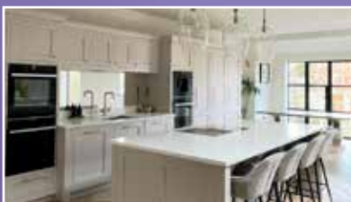
Project by Cheshire Building and Joinery Ltd