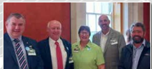
FMB NI in Stormont